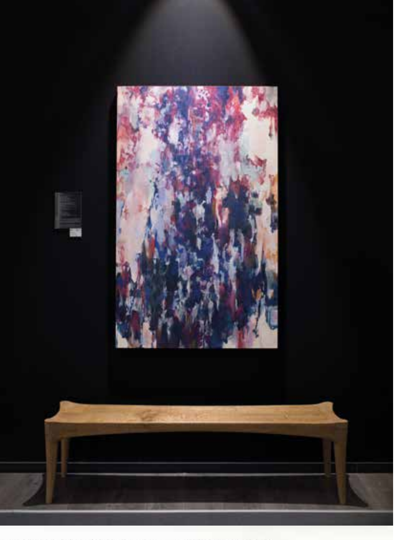
BARNSLEY WORKSHOP PETERSFIELD